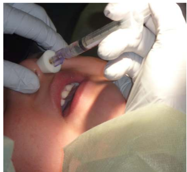
Figure 2 Child receiving intranasal midazolam using an aerosolization device.

Nasal mucosal secretions can also affect intranasal drug absorption. The buccal mucosa has a rich blood supply and is relatively permeable, yielding pharmacokinetics that are similar to intranasal administration. It therefore appears to be an attractive alternative to the intranasal route. 38 Buccal administration of aerosolized midazolam has been proven to be safe, effective, and well accepted by young patients. 28,39,40 An oral solution may also be used in place of aerosol spray; however, the possibility of experiencing the bitter taste increases, leading to poor patient acceptance. 40 Buccal and intranasal midazolam have the same maximum working time while intranasal has a faster onset time. Intranasal midazolam also elicited less crying and produced a greater proportion of patients with optimal sedation scores. 41 Chopra et al and