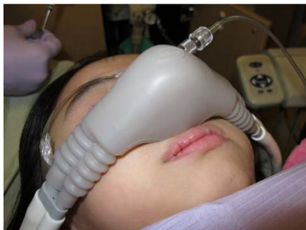
Figure 1 Nitrous oxide nasal hood modified for use with an end-tidal carbon dioxide sampling line.

In response to growing safety concerns, E_tCO_2 monitoring is now used increasingly in ambulatory settings 17,18,20,25 (Figure 1). Professional association guidelines reflect this trend, and the American Society of Anesthesiologists has amended its standards for basic anesthetic monitoring to require E_tCO_2 for moderate or deep sedation. 25 In dentistry, perhaps the most widely recognized professional sedation guidelines come from the American Dental Association. For children 12 years of age and under, the American Dental Association recognizes the American Academy of Pediatrics/American Academy of Pediatric Dentistry (AAP/AAPD) guidelines for monitoring and management of pediatric patients during and after sedation for diagnostic and therapeutic procedures. Both the American Dental Association and the AAP/AAPD guidelines suggest that E_tCO_2 monitoring may