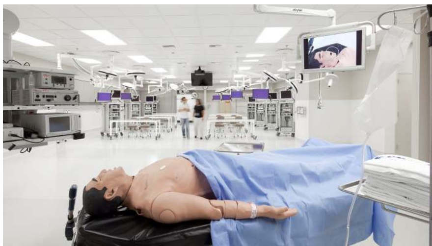
Figure 5 High fidelity mannequin in a state-of-the-art simulation facility.

developing brain. 68–70 Initial research demonstrated harm to the brains of young animals. 71–74 This raised concern that young children might also be at risk when exposed to anesthetic agents. 75 Following the publication of these concerning findings, human studies were initiated. 76–79 The results have often revealed conflicting conclusions, with some showing long-term deficits in learning and behavior while others have not. 80 This is a difficult area of study, because children who receive sedation and anesthesia commonly have pathologic conditions for which they require surgery. They may therefore be fundamentally distinct from their healthy peers. Adverse neurologic outcomes are also difficult to recognize