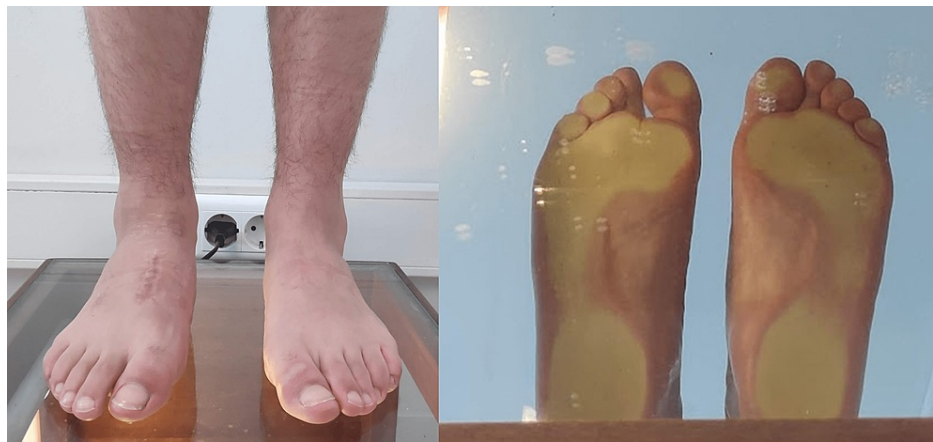
FIGURE 6: Foot morphology on the podoscope

The foot maintained a good configuration without significant malalignment, with a neutral Foot Posture Index-6 and a normal podoscopy (Figure 6).