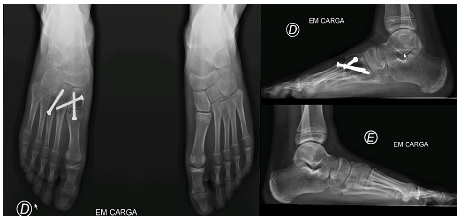
FIGURE 5: Weight-bearing bilateral X-rays: 4 months postoperative.

After four months, the patient was asymptomatic, with a normal range of motion, no limitations on daily activities, and radiographic signs of a union. So, removal of the osteosynthesis material was proposed at this stage (Figure 5).