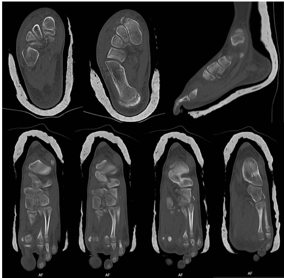
FIGURE 2: Computerized Tomography scan images.

Based on the clinical and radiographical findings he was diagnosed with a Lisfranc fracture-dislocation of the right foot - Myerson type B2.