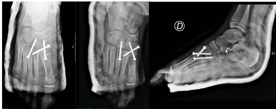
FIGURE 4: Postoperative X-rays.

Periodic clinical evaluations and X-rays were performed after two weeks, six weeks, and four months. He maintained immobilization for six weeks; after that period, progressive weight bearing was allowed and physiotherapy was started. No sports activities were allowed for four months.