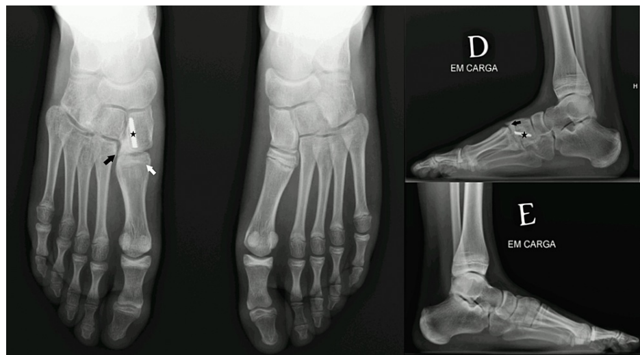
FIGURE 7: Weight-bearing bilateral X-rays: 18 months post-operative.

Radiologically, a spur was present on the medial cuneiform, which may correspond to the calcification of the Lisfranc ligament. Additionally, although the good alignment was maintained, there was the development of a premature physal arrest on the base of the first metatarsal with the shortening of this bone (Figure 7).