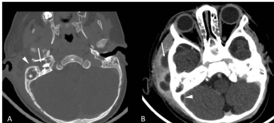
Fig. 1 a On bone window of the pre-contrast CT showed complete obliteration of the tympanic cavity (arrow), the mastoid (asterisk) and the external auditory canal (arrowhead), compatible with an otomastoiditis. b Contrast-enhanced CT showed multiple abscesses in the right preauricular soft-tissue (arrow) and the thrombosis of the right sigmoid sinus (arrowhead)

Otogenic CVST is a rare condition in the pediatric age group, but has a high mortality rate (5–10%) and can be associated with severe clinical morbidities if not promptly diagnosed and treated [7]. How the disease should be managed, however, is still a matter of debate. To better discuss possible clinical presentation,