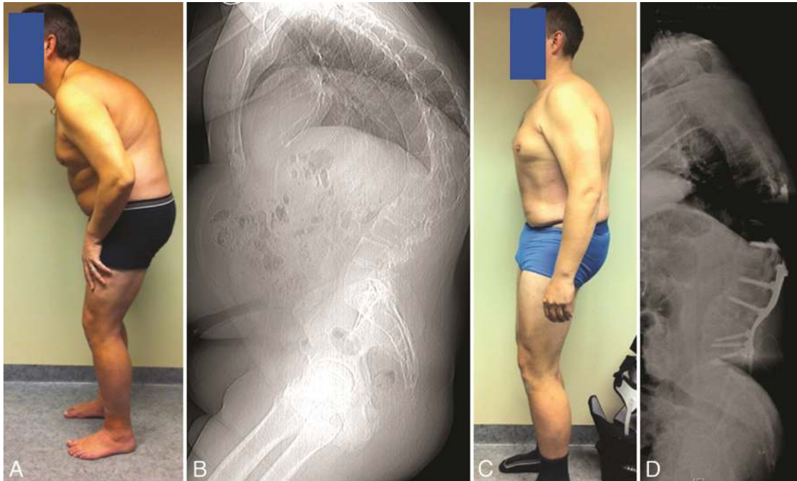
FIG. 2. Preoperative (A and B) and postoperative (C and D) clinical photographs and radiographs obtained in a 42-year-old male patient who was severely disabled and used a wheelchair outdoors due to ankylosing spondylitis and severe rigid kyphosis. He underwent double PSO at T-12 and L-3 and achieved an excellent clinical outcome. Figure is available in color online only.

significantly more frequently in the degenerative group (10 of 28 patients; 35.7%) compared with the deformity group (5 of 76 patients; 6.5%). Neurological complications occurred in 11% of the patients. The most common complication was weakness in hip flexion or knee extension. All but 2 patients recovered completely by the end of 1 year (Table 6).