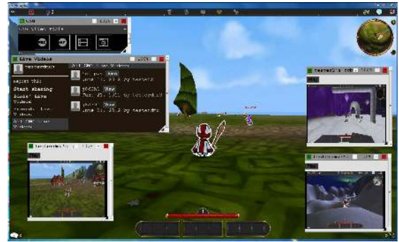
Fig. 3: Snapshot of the CNG P2P system.

A root of a Level 1 multicast tree ( r_1 and r_2 in Fig. 2) immediately forwards packets directly received from the source to the Level 2 multicast trees associated to it (one tree for r_1 and two trees for r_2 in Fig. 2). Moreover, as soon as it successfully decodes a source block, it sends an acknowledgment to the source, so that the source stops sending it packets, and it creates new encoded packets by applying rateless coding on the decoded source block. Then it sends these new encoded packets to Level 2 peers over the multicast trees associated to it (ignoring those already used). The number of packets sent