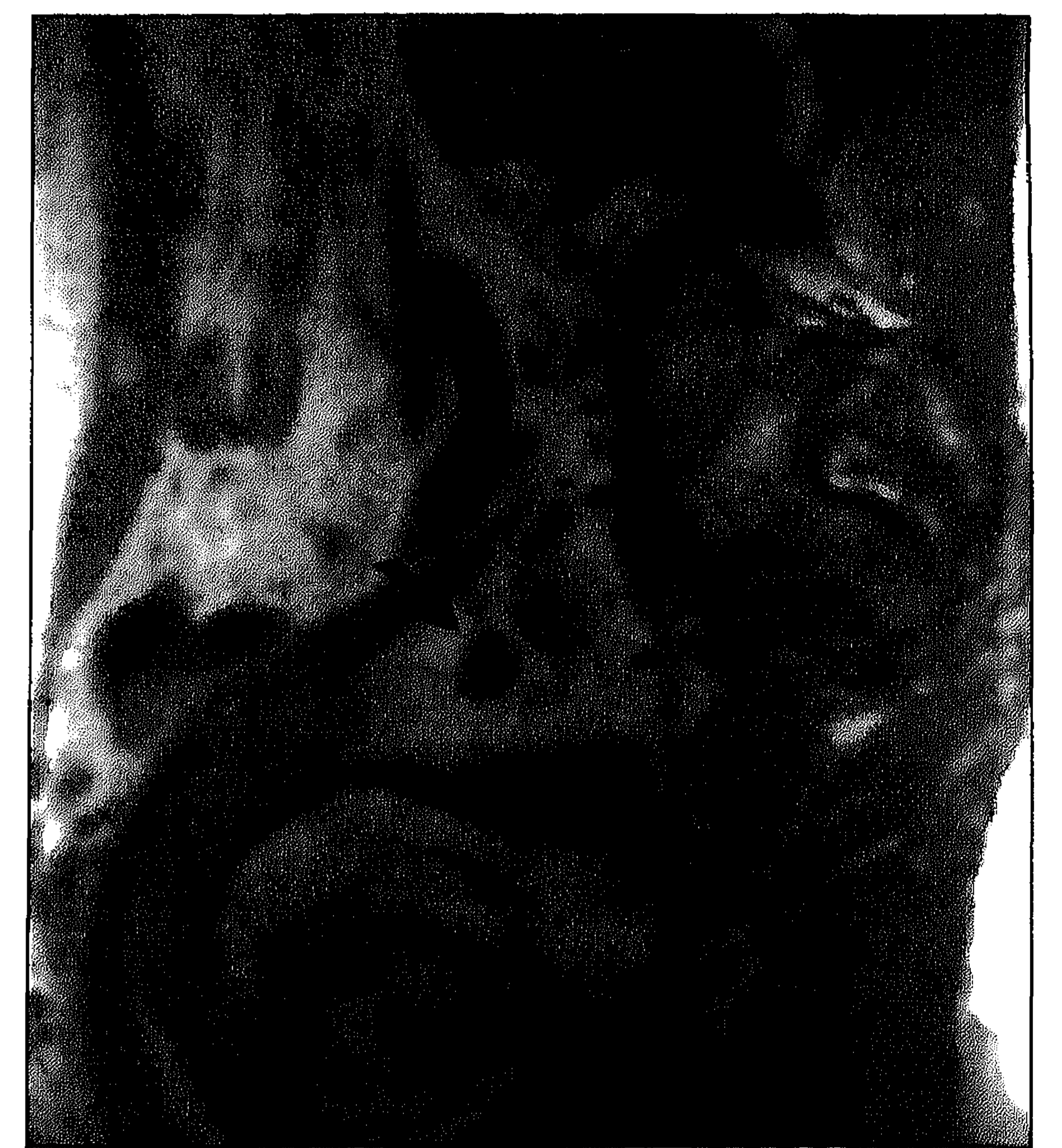
Fig. 1. —Lymph node metastases in 54-year-old man with T3b urinary bladder carcinoma. A , Reconstructed three-dimensional magnetization-prepared-rapid gradient-echo (3D MP-RAGE) image in plane parallel to right external iliac vessel shows enlarged lymph node ( arrow ). B , Reconstructed 3D MP-RAGE image in slightly angulated coronal plane reveals enlarged lymph nodes ( arrows ) along course of iliac vessels (diameter, 12 mm). Histologic examination after fine-needle aspiration biopsy revealed metastatic deposits.