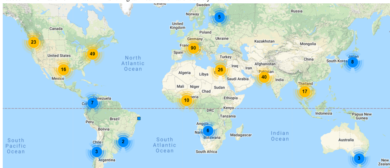
Figure 3. Main locations of the DHPSP's Twitter followers. These data cover only a fraction of the DHPSP followers who indicated their location in their account information on Twitter. DHPSP: Digital Health and Patient Safety Platform.