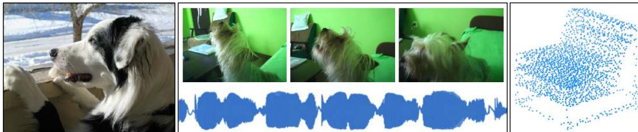
Figure 2. We train the Perceiver architecture on images from ImageNet (Deng et al., 2009) (left), video and audio from AudioSet (Gemmeke et al., 2017) (considered both multi- and uni-modally) (center), and 3D point clouds from ModelNet40 (Wu et al., 2015) (right). Essentially no architectural changes are required to use the model on a diverse range of input data.

2020b) produces linear-complexity self-attention modules by projecting key and value inputs to arrays with a size smaller than the input. Unlike this prior work, the Perceiver uses cross-attention not only to get linear complexity layers, but also to decouple network depth from the input size. As discussed in Sec. 3, it is this decoupling and not merely linear scaling that allows us to build very deep architectures, which appear to be essential for good performance on challenging tasks in a range of domains. We discuss the relationship between the Perceiver and the Set Transformer in more detail in Appendix Sec. A.