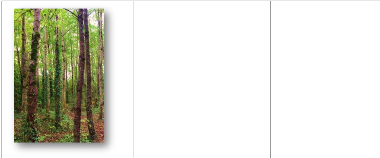
Table 2. Framework for analysis example