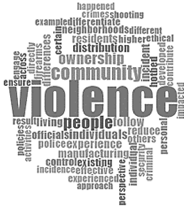
Figure 2. Word cloud depicting top 50 high-frequency words shared by the participants in the study.

Theme 1, acceptance of legal firearms, provided somewhat surprising but informative results. All participants in the study viewed gun manufacturing and legal gun ownership as acceptable. These results were surprising, given that the participants had been direct or indirect victims of gun violence. This finding is somewhat in contrast with literature that seemed to present extreme views on the issue. For instance, Squires (2012) argued that some aspects of American culture seem to accommodate what is identified as “gun culture,” a phrase that was presumably adapted from Hofstadter’s writings on America as a gun culture. Conversely, most Americans who support gun control proposals tend to condemn the longstanding gun culture (Brent et al., 2013). In contrast to these two opinions, the victims of gun violence appeared to maintain a nonpolar narrative. They had suffered the consequences of weak gun control laws, while on the