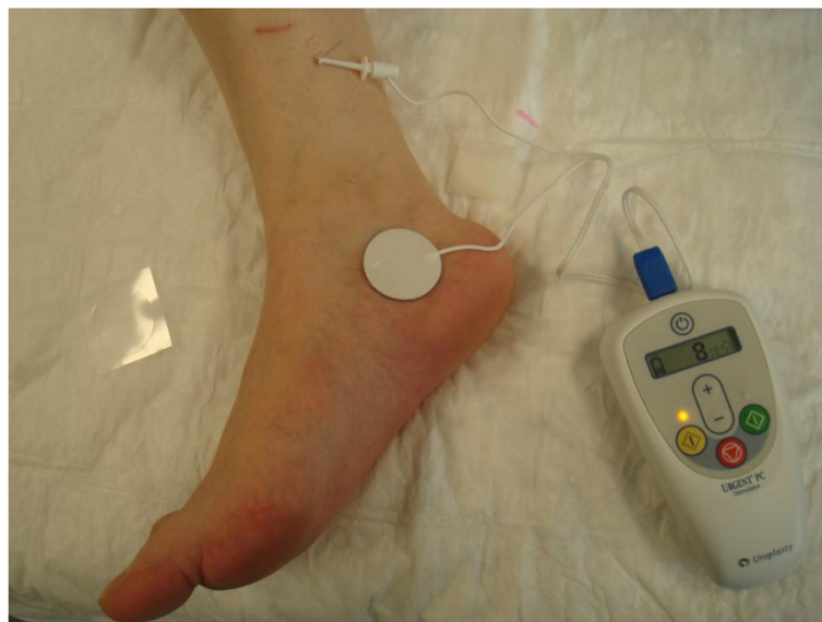
Figure 1 Stimulator and technique for percutaneous tibial nerve stimulation (PTNS).

Despite the lack of certainty about the mechanism of action of PTNS, in the last decade this technique has been widely used for the treatment of overactive bladder syndrome (OAB) and results of PTNS on non-obstructive urinary retention (NOUR), neurogenic bladder, paediatric voiding dysfunctions and chronic pelvic pain/painful bladder syndrome (CPP/PBS) have been described as well.