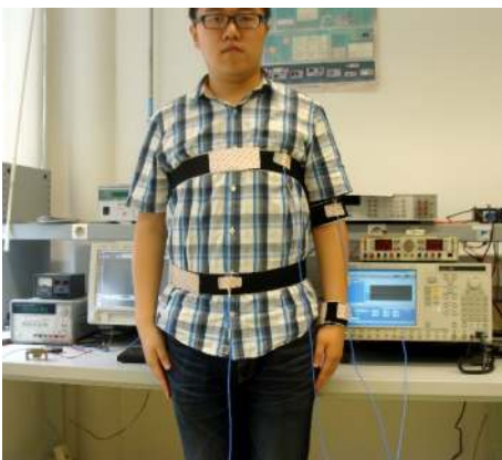
Fig. 1. On-body measurement experiment.

where p corresponds to the start position of the m^{\text{th}} symbol which is equal to mT_{sym} + h^{(m)}T_w . If the decision variable is larger than zero, the received bit is detected as zero, otherwise it is one.