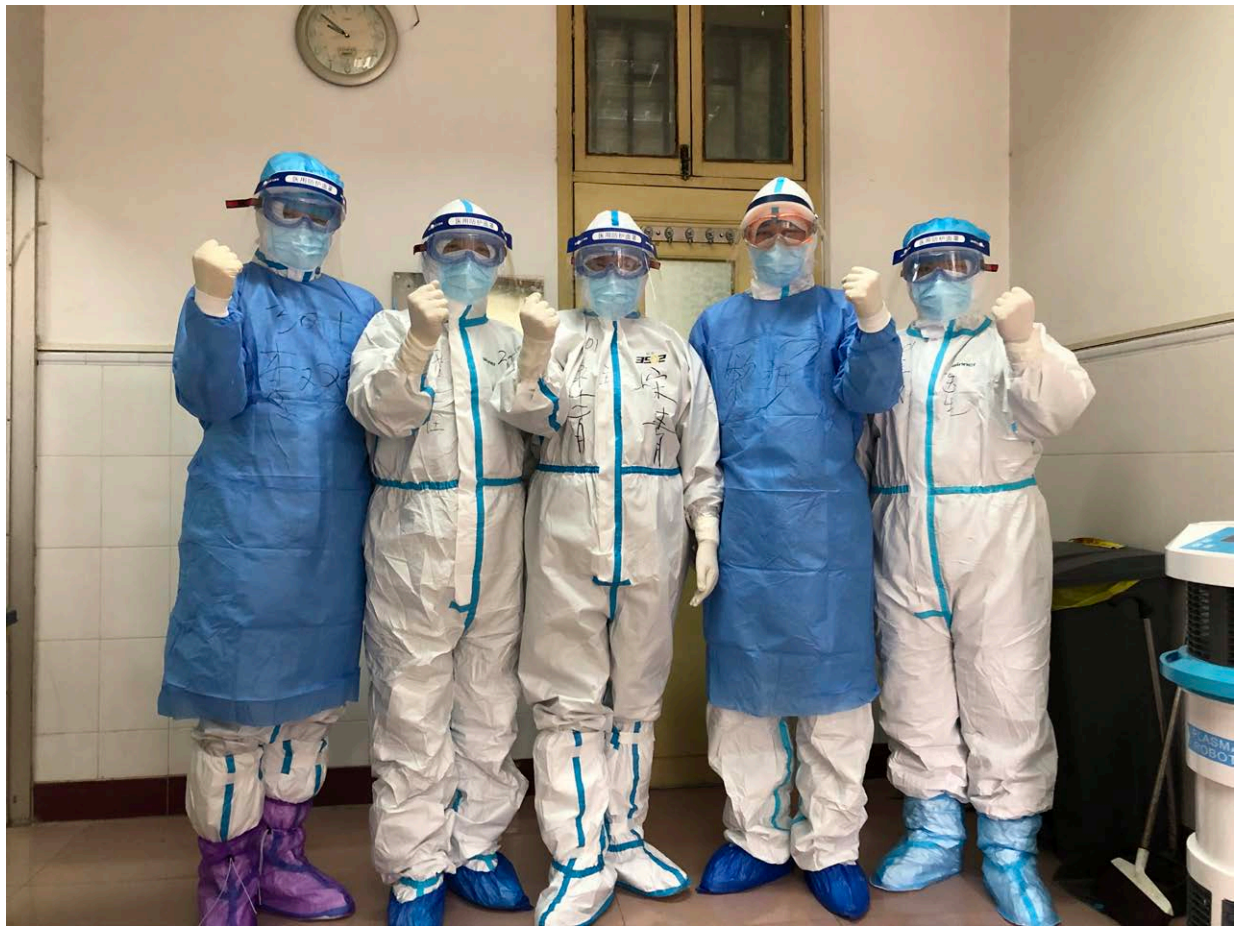
Fig. 1. Psychologic preparation and self-encouragement.

and protective measures in order to safely provide care to patients. Psychological support may also be needed for healthcare workers providing direct care to infectious patients (fig. 1).