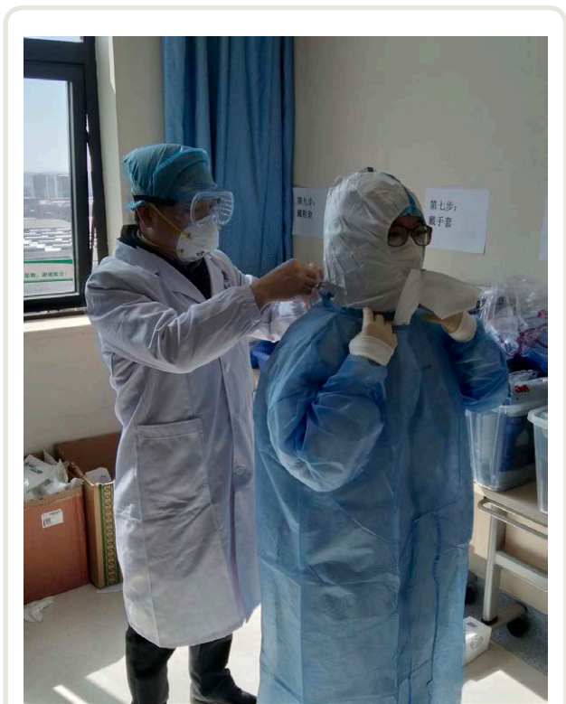
Fig. 2. Personal protective equipment self-check and inspection by another colleague.

Caution should be taken to ensure that the wet gauze does not obstruct the patient's airway. Sufficient muscle relaxation should be obtained to prevent coughing during intubation.