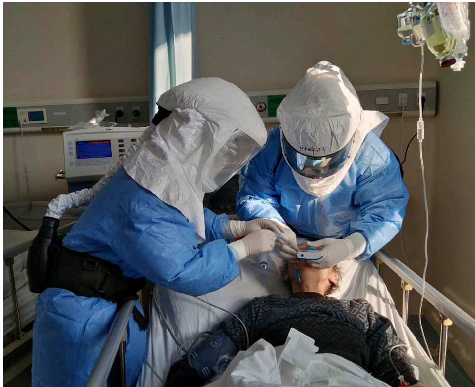
Fig. 4. Intubation with video laryngoscopes and keeping distance from the head of patient.

effort is needed to avoid severe hypoxemia. The choice of induction drugs is dictated by hemodynamic considerations. Midazolam 2 to 5 mg with etomidate (10 to 20 mg) or propofol, if the patient's hemodynamics allow, can be used for induction. Fentanyl 100 to 150 \mu g or sufentanil of 10 to 15 \mu g is recommended to be administered intravenously for an adult patient to suppress laryngeal reflexes and provide optimal conditions for intubation. If no contraindications are present, succinylcholine 1 mg/kg should be administered immediately after loss of consciousness, and intubation can be carried out after muscle fasciculation is completed. If rocuronium 1 mg/kg is used, sugammadex should be immediately available in case "cannot intubate/cannot oxygenate" is encountered. For critically ill patients with COVID-19 pneumonia, patients may develop pulmonary hypertension. The care team must make a great effort to avoid or minimize hypercarbia.