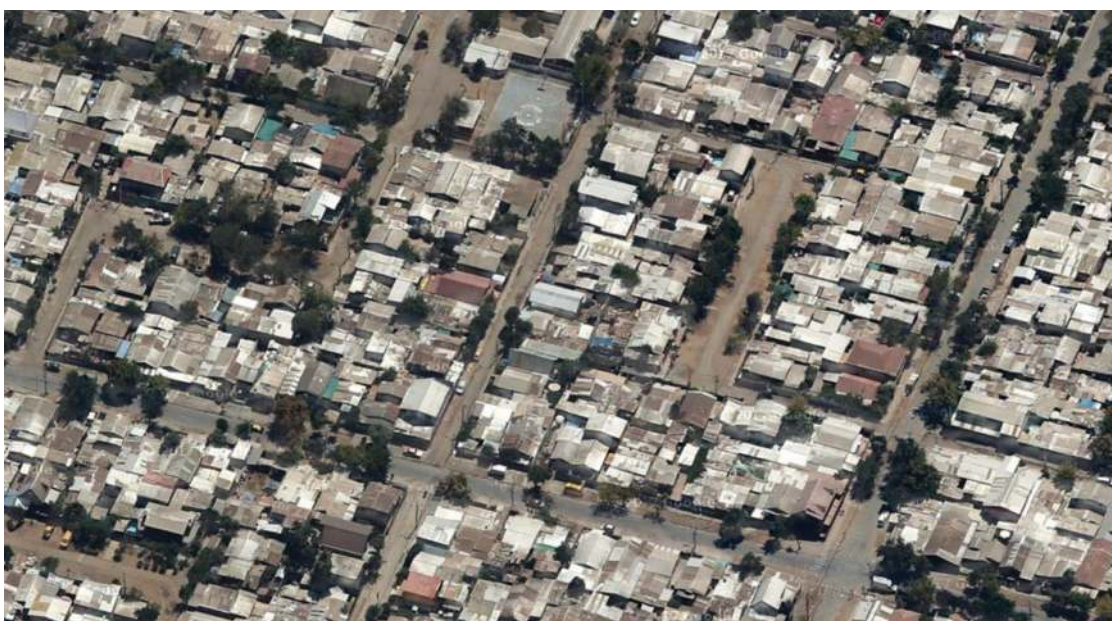
Photo 2 View on the peripheral urbanization 'La Faena', an 'Operation Plot of Land' in 2016.

At Villa La Reina, the need to self-build became a foundational experience, a protracted process that left behind enduring memories of "...entire families working full shifts on Saturday and Sunday" (Márquez 2008: 357) (see Photo 3 where the image shows, that even women worked in construction trades). As Márquez notes (2008: 366), "[I]dentity is not just narrative. It is also the ability to take action and rally the troops". "This condition of identity is known as territoriality, a trait shared by all social actors and thus a basic component of identity" (Márquez 2008: 366). As Garcés notes, "the wisdom of the people" has been around forever; to feed into scholarly debate, it just requires that "social identity experiences and signs" be accorded a higher profile (Garcés 2002: 24).