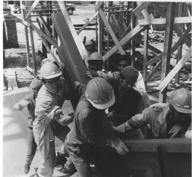
Photo 4 Image of the construction of the UNCTAD III building, 1972.

ed in record time, the monumental complex became a source of pride for those who built it and a source of admiration for the public at large (Photo 4).