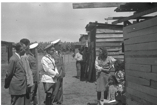
Photo 1 The general commissioner of subsistence and prices visiting informal settlements, 1948. Photo credit: M. Rubio Feliz, 1948. Source: Museo Histórico Nacional, Archive [National Historical Museum], n.d., Picture N-3455

Prior experiences with state responses to housing demands had been disappointing. Government policy on releasing urban land for housing was vague, and practices on locating and evicting squatter camps were erratic at best ( Espinoza 1988 ). Espinoza , based on press accounts at the time, recounts the significant experience gained by local residents who successfully acquired technical skills, organized initiatives, and ably dealt with the authorities. They put forward thoughtful demands that included collective resettlement to more centrally-located areas and an emphasis on self-building ( Espinoza 1988 ). Land occupation as a device quickly caught on. Squatters formed social and neighborhood committees, then founded a National Housing Front to negotiate with authorities ( Garcés 2002: 340-41 ) that had remained largely unable to provide a proper response. Given the state's failure to address demand for housing and land, and as it proposed joint action by private institutions, residents, and the state, this mechanism eventually grew into an option the government could live with ( Espinoza 1988 ).