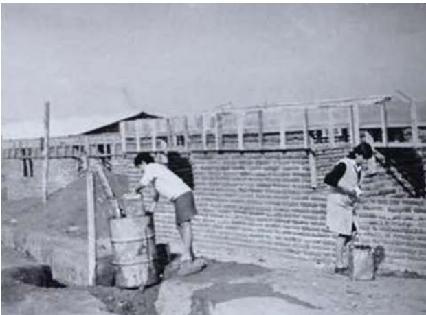
Photo 3 Villa La Reina: Women working in construction trades and the creation of construction of micro businesses managed by the neighbours themselves.