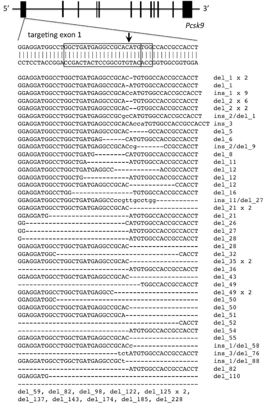
Supplemental Figure 1. Mutagenesis of Pcsk9 in vivo with CRISPR-Cas9. The CRISPR-Cas9 target site in Pcsk9 exon 1 is shown. The boxes indicate the 20-bp sequence matching the protospacer and the 3-bp PAM. The predicted site of Cas9-induced double-strand breaks is indicated with an arrow. Deletions and insertions detected by PCR amplification and Sanger sequencing of the on-target site in liver genomic DNA from a representative mouse (“C” in Figure 1) that received an adenovirus expressing Cas9 and the guide RNA for the target site (CRISPR- Pcsk9 ) are shown. At the bottom are deletions that spanned the entire site.