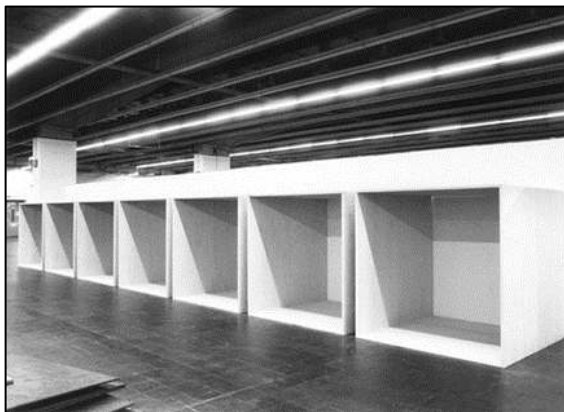
Figures 1 and 2, First Page for Certificate and Later Installation Shot for Donald Judd, Untitled [seven plywood boxes] (1972–1973).