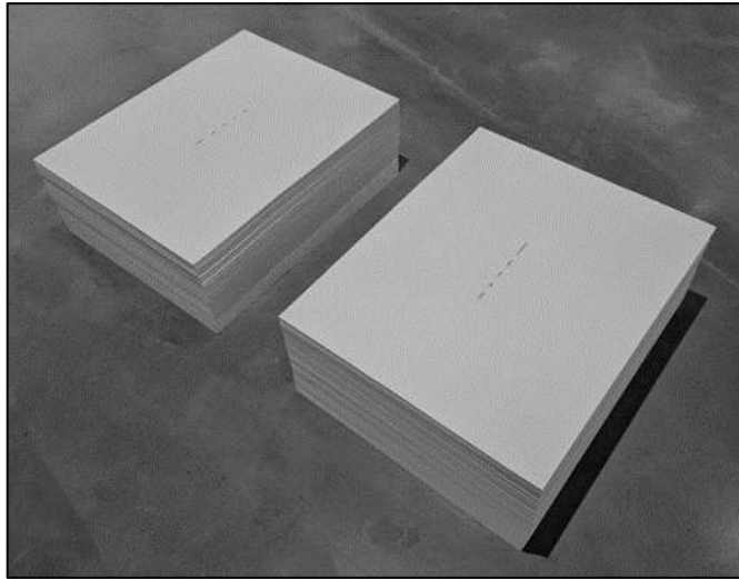
Figure 3 55

Felix Gonzalez-Torres, “Untitled” 1989/1990, Print on paper, endless copies, 26 in. at ideal height x 29 x 56 in. overall (Original paper size: 29 x 23 inches).