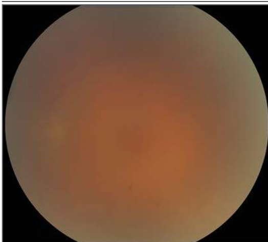
Figure 3. Fundus Photograph of the Left Eye 14 Weeks after the Onset of Ebola Virus Disease.

In conclusion, our patient's recovery from EVD was complicated by acute anterior uveitis, which rapidly evolved into a sight-threatening panuveitis with detection of persistent EBOV within the eye. This case highlights an important complication of EVD with major implications for both individual and public health that are immediately relevant to the ongoing West African outbreak. It is reassuring that samples of conjunctivae and tears tested negative for EBOV, a finding that supports previous studies suggesting that patients who recover from EVD pose no risk of spreading the infection through casual