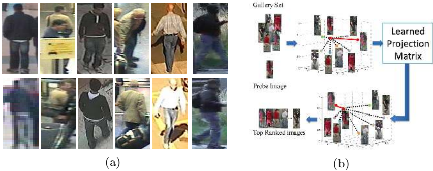
Fig. 1. The re-ID problem. (a) Challenges (left to right): low resolution, occlusion, viewpoint, pose, and illumination variations and similar appearance of different people. (b) Projecting the data improves classification performance.

Most re-ID approaches use appearance-based features that are viewpoint quasi-invariant [2, 3, 5, 11, 12, 14, 25] such as color and texture descriptors. However, the number and support of features used varies greatly across approaches making it difficult to compare their impact on performance. Using standard metrics such as Euclidean distance to match images based on this type of features results in poor performance due to the large variations in pose and illumination and limited training data. Thus, recent approaches [18, 20, 21, 29, 31] design classifiers to learn specialized metrics (see Figure 1(b)), that enforce features from the same individual to be closer than features from different individuals. Yet, state-of-the-art performance remains low, slightly above 30% for the best match. Performance is often reported on standard datasets that bring in different biases. Moreover, the number of datasets and the experimental evaluation protocols used vary greatly across approaches, making difficult to compare them.