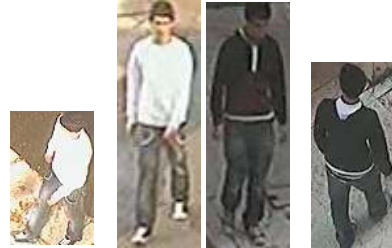
Fig. 4. View point variation in 3DPeS