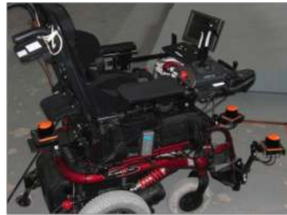
Fig. 1. The SmartWheeler robot.

A Husky A200 from Clearpath Robotics (shown in Fig. 2) is used for the outdoor experiments in this work. This robot has been used for mapping, localization, route following and autonomous navigation on rugged terrain, such as sand, gravel and grass. An on-board computer is used to interface low-level controllers and sensors, as well as to process visual and range measurements. Typically, an additional computer is mounted on top of the platform for applications with high computational requirements. A Hokuyo URG-04LX-UG01 laser sensor, mounted on the front of the robot, is used to collect the 2D scans used in this study.