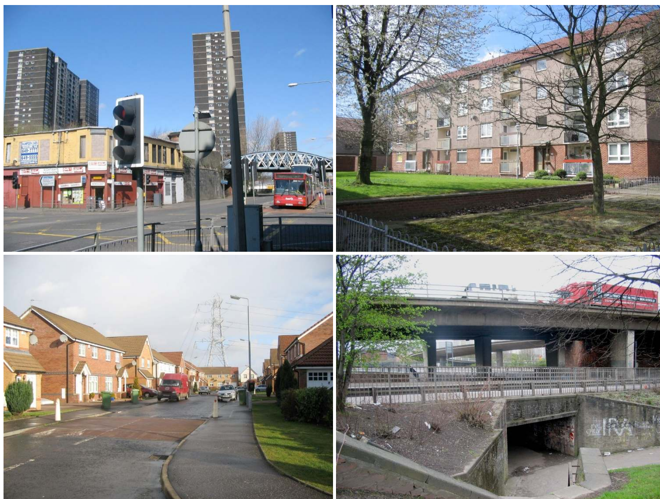
Figure 2 Examples of scenes in and around the local study areas.

calculated the estimated total physical activity energy expenditure for each respondent (MET-min/week) and used a combination of frequency, duration and total energy expenditure to assign each respondent to a 'high', 'moderate' or 'low' category of overall physical activity in accordance with the prescribed IPAQ algorithm. The 'high' category corresponds to a sufficient level of physical activity to meet current public health recommendations for adults [20].