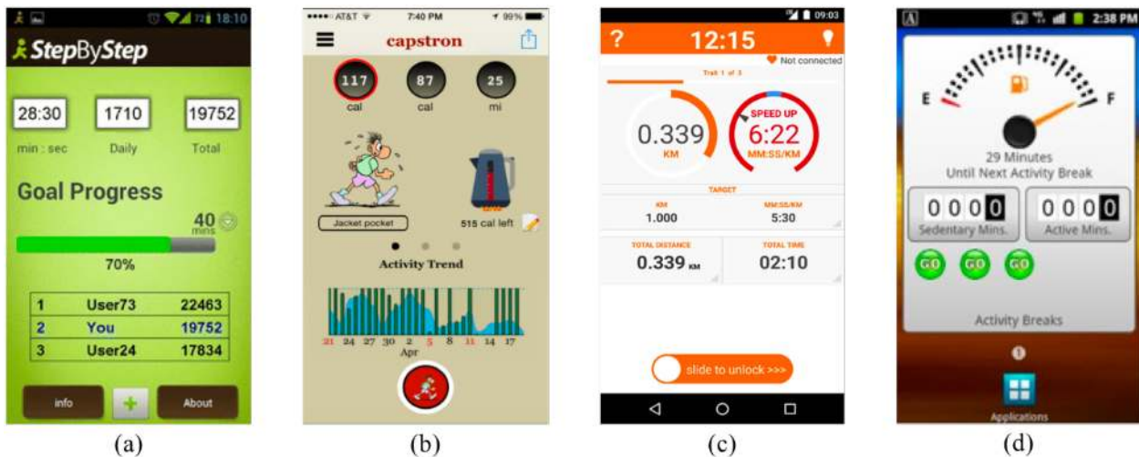
Fig. 2. Example screenshots of 4 real-time PA coaching applications. (a) StepByStep [54], (b) iBurnCalorie [56], (c) u4fit [62] and (d) B-Mobile [64].

continuously adapts goals based on the user's real-world behavior and weight.