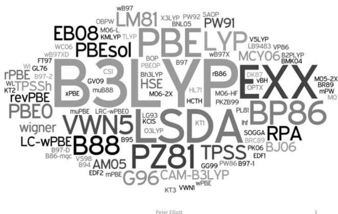
FIG. 3. The alphabet soup of approximate functionals available in a code near you.