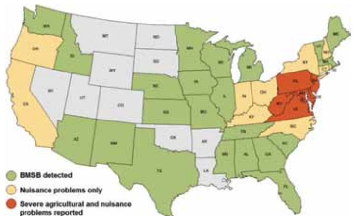
Figure 1. Distribution and impact of BMSB in the USA based on State records and BMSB Working Group assessments as reported by May 2012. In addition, at least one unofficial detection has been made in CO.

General Biology. Adults are distinguished from other brown stink bugs in the USA by their larger size, light colored banding on the antennae and legs and alternating light and dark bands around the abdomen (Figure 2). The term ‘marmorated’ means having a marbled or streaked appearance. Females emerge with undeveloped ovaries and must feed before mating. Once mated, females lay light green egg masses of ~28 eggs on the undersides of leaves. Depending