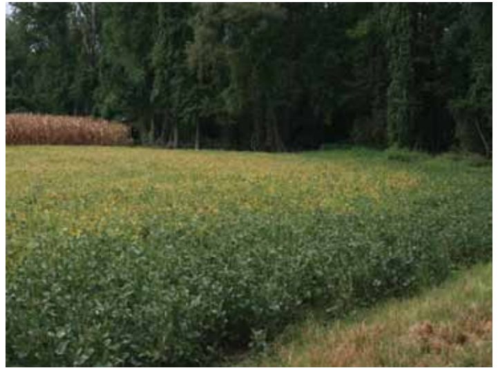
Figure 7. BMSB feeding injury to the periphery of a soybean field illustrating the “stay green” effect and contrasting with the unaffected, normally senescing plants at the center of the plot.

perimeter treatments and identifying BMSB densities needed to cause delayed plant maturity, the “stay green effect” (Figure 7). Results from insecticide trials conducted in VA and MD indicate that most labeled products provide control though further information including residual activity is needed. Several wheat fields in MD were reported to contain very high BMSB adults and one field yielded egg masses. Most adults were near the field edge, adjacent to wooded borders. Research on native stink bugs indicates that the most susceptible stages of wheat development are the milk and soft dough stages (Viator et al. 1983). This coincides with the stage of the wheat fields containing large numbers of BMSB adults. Adults from those fields laid many eggs over a very short time in the laboratory. In the absence of a more highly preferred host, wheat may be susceptible to BMSB, though more studies are needed to determine if BMSB poses a significant risk. High populations (> 3 per ear) were found on corn plants after the ear had started to form especially within the first 12 meters of field margins in DE. Unlike soybeans, perimeter treatments are generally impractical for treatment of late-stage corn. A pilot investigation in MD to determine how the surrounding landscape influences densities in field corn suggests that corn fields bordered by woodlots, other crops, and buildings have higher populations compared with fields bordered by roads.