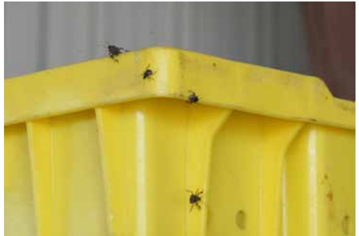
Figure 5. BMSB nymphs crawling from a container of machine-harvested blueberries highlighting the problem of contamination at harvest.

Small Fruit. Little is known about the impact of BMSB in small fruit crops. Research is underway to establish the impact of BMSB feeding, determine BMSB phenology, and to identify landscape and temporal risk factors associated with BMSB on small fruit crops. In blueberries, BMSB was first observed during the late-season in 2010, and many NJ blueberry growers have since reported it in and around structures and houses. Contamination risks are a great concern to blueberry growers who mechanically harvest and then sell to processors or ship to other countries and regions within the USA (Figure 5). During 2011, BMSB populations in NJ blueberry farms remained low and did not require control measures. In caneberries, stink bug species cause two types of injury. Although not thoroughly investigated, it appears that early