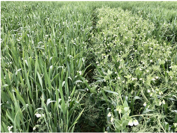
Fig. 4 Intercropping enhances plant diversity in order to limit yield losses due to pests. This diversification scheme requires species and varieties adapted to coexist and to interact with the environment. The various stages of plant breeding and selection must therefore account for new criteria to optimize the adaptation and interaction capacities of plants with their biotic environment. The expected benefits are a better resistance and a great associated diversity to regulate the feedback loops between the soil and the plant diversity (REMIX project, INRAE (2021)).

breeding programs to capture benefits of genetic diversity (Gaudio et al. 2019). Some European programs as DIVERSIFY or REMIX on cropped species (refer also to the European initiative “Crop Diversification Cluster”) pointed out some results that support this assertion (Annicchiarico et al. 2019; Jäck et al. 2021). Genetic diversity could indeed promote species diversity in plant communities (Prieto et al. 2015; Meilhac et al. 2019), through genetic and ecological mechanisms (Meilhac et al. 2020). Thus, increasing diversity requires considering jointly multiple levels of biodiversity (i.e., genes, population, or community). To date, breeding programs have had difficulty deriving value from the benefits of inter- or intra-crop mixtures due to the few traits that they consider (Litrico and Violle 2015). In contrast, breeding programs have aimed for the standardization required by the food supply chain.