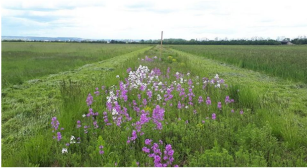
Fig. 1 Introducing flowerbeds at the edge of the field makes it possible to reproduce semi-natural habitats that are rich in plant biodiversity and offer habitat and trophic resources to the auxiliaries; this during a large part of the year, especially during periods when there is no more culture in place. By keeping the auxiliaries in these strips, farmers enable them to more easily play their role of natural pest control in neighboring plots, provided that the practices on these plots be well thought out.

without pesticides, and (3) propose scientific challenges that enhance synergies between these fronts. Throughout this article, we use “pesticide” to refer to “chemical pesticides,” defined as synthetic or natural pesticides that have a negative impact on the environment and human health (including some products used in organic production or for biocontrol).