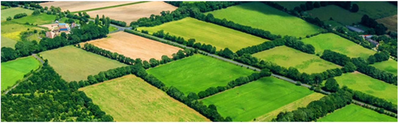
Fig. 2 Pesticide-free agriculture cannot be conceived without managing the spatial heterogeneity of landscapes: the design of mosaics of cropping systems, in interaction with semi-natural habitats, is essen-

tial to promote the ecological processes that lead to natural regulation of pests. Here, the continuity of the hedges enhances the flow of organisms.