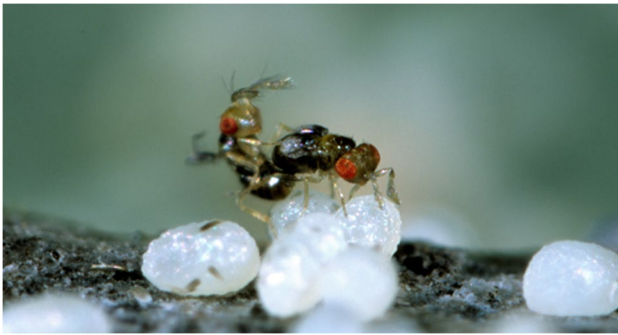
Fig. 3 The use of Trichogramma micro-wasps against lepidopteran pests has been an undeniable biocontrol success story for several decades. Despite this success, this example also illustrates the kind of biocontrol challenges that can be facilitated in a pesticide-free system perspective. The use of biocontrol strategies could be drastically increased (it is currently limited to 10–20% of potential target areas), diversified in terms of target crops, and based not only on massive inundative releases but also on inoculations followed by long-term management of populations. These evolutions can be fostered by the development of new business models, which deviate from the current strategies conceived for massively used pesticides.

niche markets with no current control solution). Analyzing the issues that pests cause in pesticide-free cropping systems while identifying biocontrol solutions adapted to each issue should become a research and innovation activity in itself. It should be based on analyzing (1) pest control issues in a variety of cropping systems and associated agri-food chains with high environmental, economic, and social sustainability (and representative of systems that will become widely used in the future); (2) factors that influence the severity of these pest issues in these systems; and (3) the fit of potential types of biocontrol strategies (e.g., classical, conservation) with the target pest issue, cropping system, and agri-food chain. Doing so would comprehensively identify needs of each type of agri-food chain and geographic area, and would provide insights into the expected role and technical and economic characteristics of potentially relevant biocontrol strategies. This will enable research and innovation investment strategies and market analysis methods to be adjusted for both public and private stakeholders.