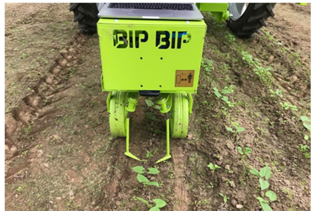
Fig. 5 The ability to control weed management in the row is a key lever for implementing herbicide-free practices. Machines providing physical weeding in the rows are starting to be offered by various manufacturers. Here, the task is carried out by the BIP BIP robot that combines three fundamental functionalities: observation of the row with a camera, analysis of the situation with on-board algorithms, and carrying out an appropriate action (i.e., mechanical weeding with great efficiency and without harming the crop). Photograph of prototype 5 of the BIPBIP system designed for intra-row mechanical weeding of vegetable crops, taken by Louis Lac for the BIPBIP-project, funded by the French National Research Agency).

in order to facilitate processing of grain harvested from intercrops (Meynard et al. 2018). This is also relevant when crops are interlocked on the same field (e.g., living mulch) without being intended for harvest (Wortman et al. 2012). Overall, the equipment of these innovations must cover the needs of main crops and diversified crops at low cost.