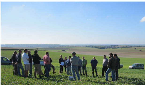
Fig. 6 The in-depth transformation of agricultural practices, necessary for the success of zero-pesticide systems, is enriched by (1) collective design processes that rely on exchanges between practitioners and researchers and promote the exploration of innovative solutions, and by (2) the confrontation of the solutions imagined to real situations of implementation (agricultural plots). Here, a group of farmers, advisers, and researchers observe the results of new practices implemented in the fields (the management of cover crops).

Paying farmers for pesticide-free practices Beyond the effectiveness of current policies, more ambitious policies to eliminate pesticides must be developed, in particular by paying farmers who use pesticide-free practices. Indeed, the expected redesign and innovations described previously may not be effective immediately after they are implemented: crop yields may decrease due to the removal of pesticides and costs may increase, in particular labor costs. This phenomenon could be temporary, lasting only during a transition period during which natural regulations are not yet established, or more permanent. Payment should thus be