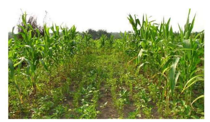
Fig. 2 Intercropping in a lowland field in South of Benin: maize, West African sorrel ( Corchorus olitorius ), and African eggplant ( Solanum macrocarpon )

Fruit crops are perennial crops and are cultivated on a longterm basis, unlike vegetables which are short-cycle, of between 2 and 8 months, as well as cash crops. Is there a