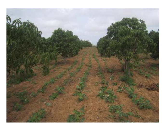
Fig. 3 Traditional intercropping cowpea in mango orchards in the Niaye area (Senegal) during rainy season (H. de Bon)