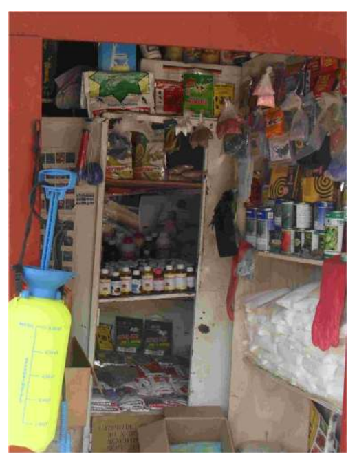
Fig. 1 Shop seller of agricultural supplies (pesticides, seeds, knapsack sprayer) in a peri-urban vegetable production area in Dakar (H. de Bon)

There are major challenges in sub-Saharan Africa, where poverty, low training, and susceptibility to pests contribute to major risks. The goal of this review is to synthetize existing literature on the current pesticide use by small horticultural growers in sub-Saharan Africa and some effective environmental