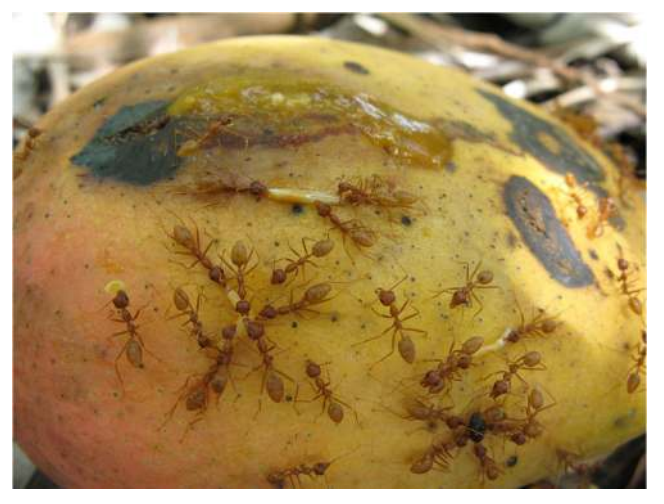
Fig. 4 Ants ( Oecophylla longinoda ) capturing fruit flies larvae in a mango, picture taken in a mango orchard in Central Benin (JF. Vayssières)