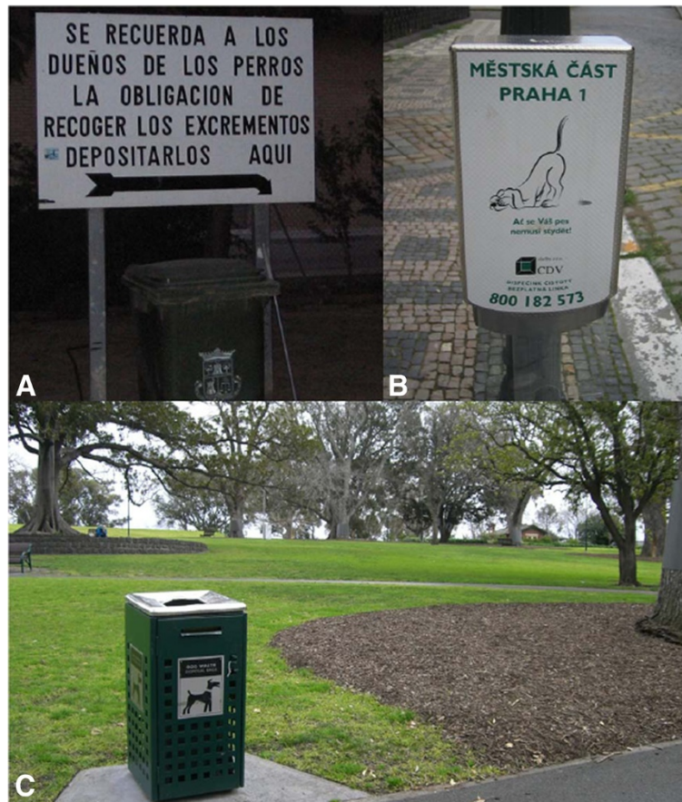
Figure 4 Dog-reserved areas and indications for pet owners in public areas in Valencia, Spain (A), Praha, Czech Republic (B) and Melbourne, Australia (C).

between the pet and the owner, even when some behaviour can be questionable (Figure 5). Actually, it is established that direct contact with infected pets presents no relevant risk in the transmission of intestinal nematodes and there is no association between pet ownership and infection occurrence [78,79]. Owners should have confidence that ownership of any companion animal is beneficial and safe as long as their pets are healthy [18]. Pet owners enjoy a plethora of advantages by living with dogs and/or cats. For instance, children, the elderly and disabled persons particularly benefit from their contact with a beloved pet. Companion animals represent a way of life for a lot of the people and this relationship provides socialization, mental health, and physical well-being: those who own a pet have been shown to display reduction in blood pressure and cholesterol levels, require less medical care, and it has also been reported that there is an improvement of life quality and quick recovery after heartbreaking events [209-213]. Therefore, owning companion animals is vital for the majority of families, especially when children and the elderly are