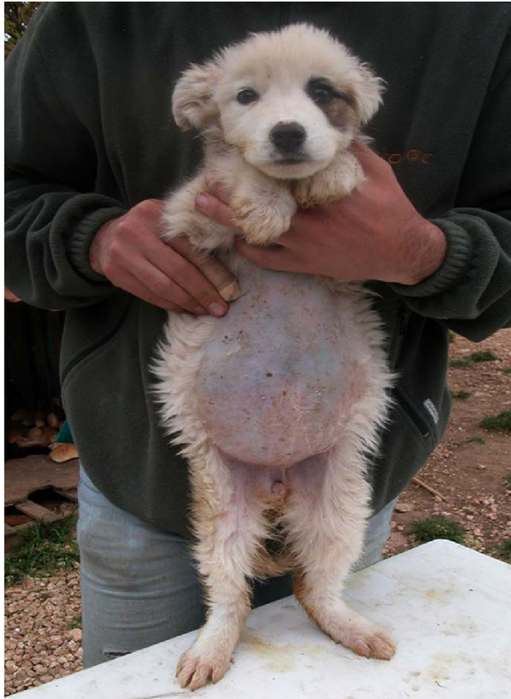
Figure 1 Pot belly in a roundworm-infected puppy.

dysbacteriosis and gas formation. In severe circumstances animals may suffer from thickened intestine, partial or total obstruction or occlusion, duodenum dilatation, peritonitis, bile and pancreatic ducts blockage, rupture of the intestine and worms at different stages expelled with the vomitus or the faeces (Figure 2); indeed, pups and kittens with heavy infections may expel a large mass of worms in vomitus [13,16,20,27], thus causing distress for the owner as the