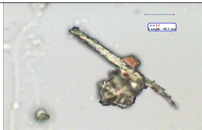
Fig. 3b: Non lignified pericyclic fibers