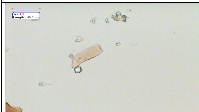
Fig. 3e: Calcium oxalate prisms