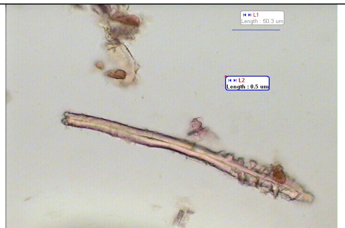
Fig. 3d: Stone cells