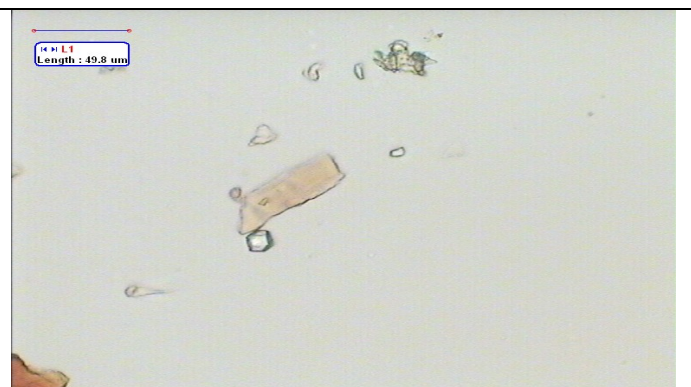
Fig. 3f: Mucilaginous cells