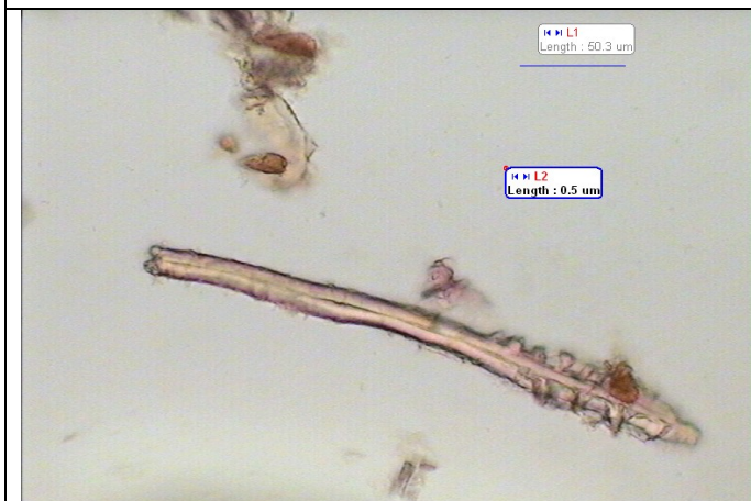
Fig. 3c: Lignified phloem fibers