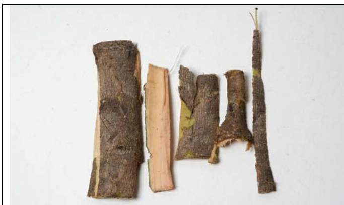
Fig. 1: Bark of Bridelia retusa Spreng