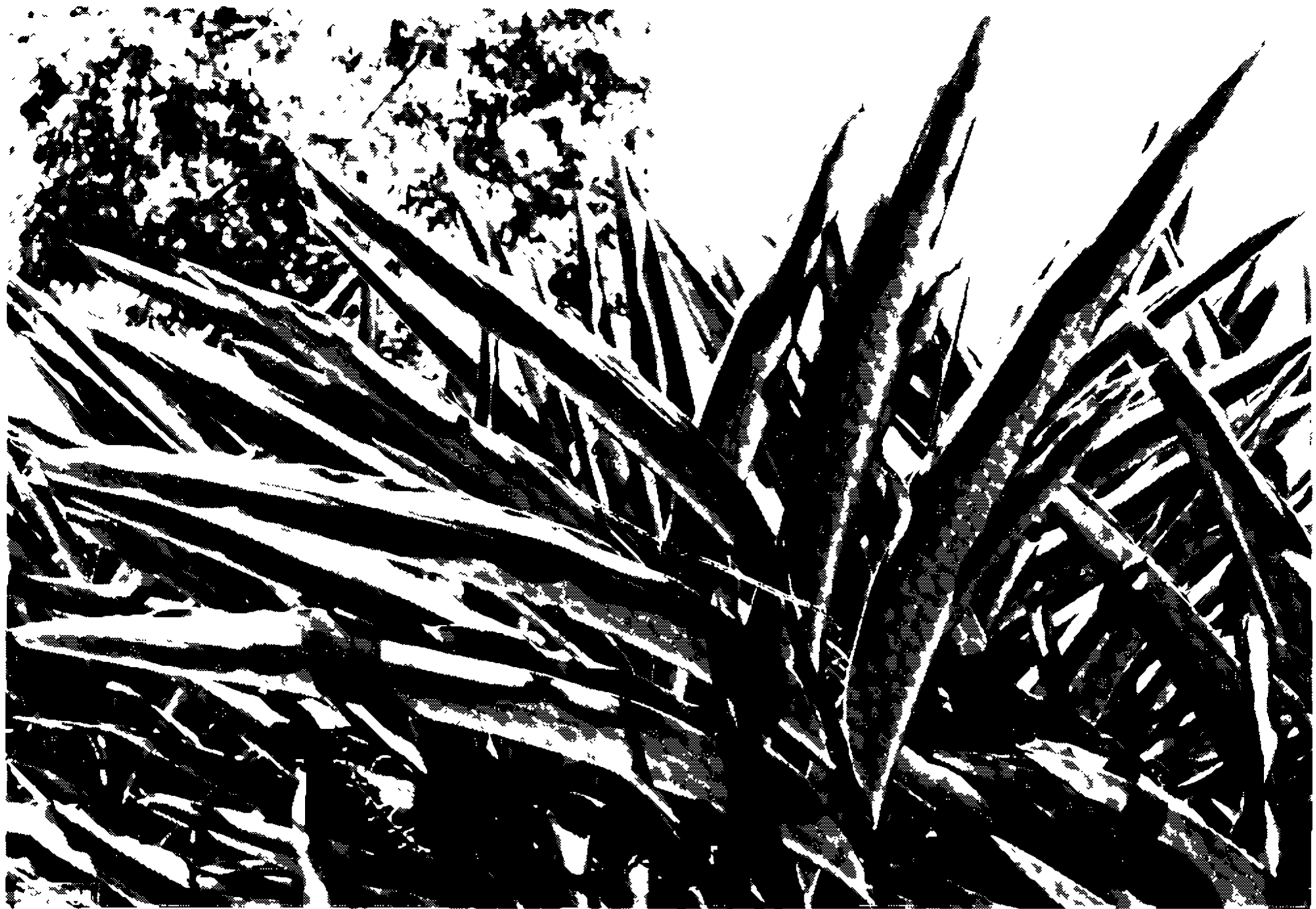
Fig. 1: Alpinia speciosa Schum – (photo obtained in the medicinal botanical garden of the Federal University of Ceará).

To prepare the tea, 3 g of fresh leaves were added to make up to 200 ml of infusion in boiling water. This preparation was used only in subacute toxicological studies.