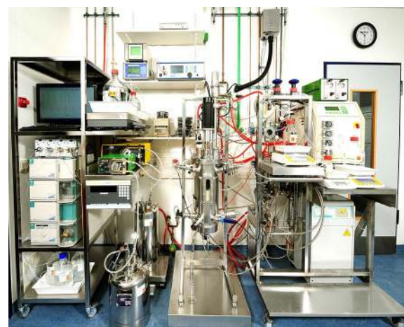
Fig. 2 Biotechnological plant for the production of antimicrobial peptides manufactured by Cornelissen. A 15-L fermenter with extended in-, on-, and at-line measurements (e.g., DO, temperature, pH, turbidity, oxygen, and carbon dioxide in off-gas, media components via HPLC, and pressure), controlled feeding and harvest for (repeated) fed batch and cyclic processing and balancing of all feeds and drains

before this time, the data availability for the antibiotics after the implementation of the European guidelines needs to be improved and will be developed with legal instruments (see “ Environmental law ” section).