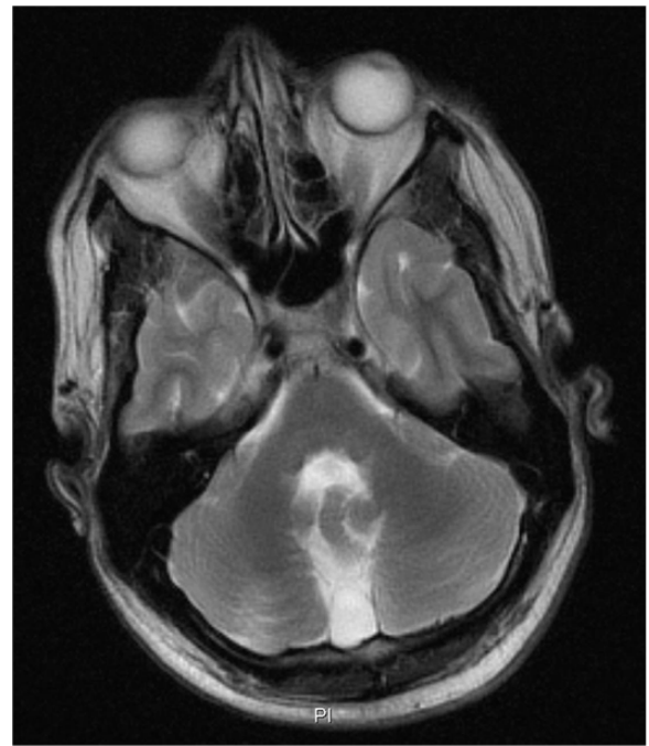
Figure 2 Transversal T2-weighted magnetic resonance imaging of the brain of Patient 1, showing hypoplasia of the cerebellar vermis.

Psychiatric examination disclosed symptoms of a severe major depression with irritability, loss of initiative, and marked sleep disturbances. Magnetic resonance imaging (MRI) of the brain showed hypoplasia of the cerebellar vermis with enlarged cisterna magna, and mild enlargement of the lateral ventricles (Figure 2). Neuropsychological assessment revealed severe ID (Vineland screener: 2 years 4 months) with marked deficits in expressive and receptive language. His cognitive profile was dominated by disordered attention and executive functioning, specifically expressed in hardly unintermittable perseverative behaviors. Citalopram was reintroduced in an increasing dose of 40 mg daily, but in the absence of effect was replaced 3 months later by nortriptyline (50 mg daily; plasma concentration 176 µg/L). Subsequent CYP2D6 genotyping revealed a polymorphism (*4/*41; intermediate metabolism) and, based on the plasma concentration, the daily dose of nortriptyline was fixed at 40 mg daily (plasma concentration: 96 µg/L). Valproic acid was continued at a stable dose of 1200 mg per day (plasma concentration: 58 mg/L). A definite diagnosis of atypical bipolar disorder was made (International Classification of Diseases-10; F.31.9). Follow-up during a period of 5 years showed that his mood and behavior clearly stabilized.