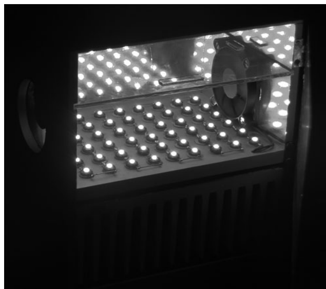
FIG. 1. Light system with 96 LEDs delivering a uniform radiation (mirrored device) with coolers to avoid heating effect. LED, light-emitting diode.

The system consisted of 96 LEDs (Edixeon; Edison Opto Corporation, New Taipei City, Taiwan). Each LED delivered a light intensity of 19 and 47.5 mW/cm 2 to the well solution (~6% of plastic absorption of light was previously deducted), centered at a wavelength of 450 nm, with an average fluency of 5.7 J/cm 2 . The presence of a cooler on the sides mitigated the heating effect and allowed the system to uniformly irradiate the wells. The internal surfaces were mirrored, and the light was evenly distributed onto each well by optimizing the distance between the LEDs and the plate (Fig. 1). A power meter (Coherent, Santa Clara, CA) was utilized to assess the power density of the incident radiation.