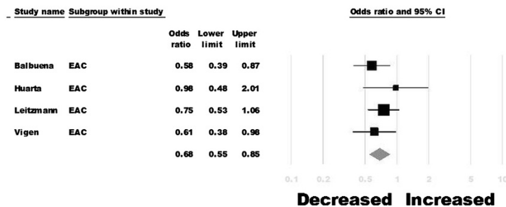
Figure 3 Physical activity and risk of esophageal adenocarcinoma.

ESCC in patients with the highest level of occupational physical activity. On meta-analysis, there was no association between physical activity and risk of ESCC (OR, 1.10; 95% CI, 0.21-5.64), albeit with considerable heterogeneity ( I^2 = 95\% ).