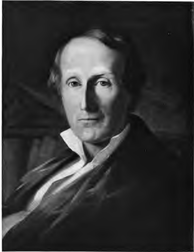
SAMUEL G. MORTON