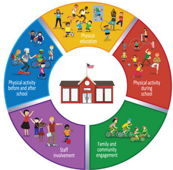
Figure 1 — Comprehensive school physical activity program framework (CDC, 2019).

CSPAPs have gained significant traction across the globe in research and professional recommendations related to youth physical activity promotion (Carson & Webster, 2020). Yet, the evidence base for CSPAPs is still young, and existing CSPAP research is mostly devoted to investigating the effectiveness of individual CSPAP components in increasing youth physical activity engagement (Goal c). Even though physical education is conceptualized as the cornerstone of a CSPAP (CDC, 2019; SHAPE America, 2015), little CSPAP research has investigated how a CSPAP or its various components can be used to help physical education meet national