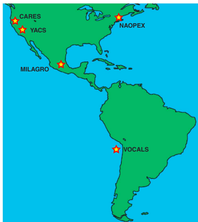
Figure 1. Map showing the geographic locations of the five field campaigns. Samples from the VOCALS campaign in Chile and the NAOPEX campaign in the Boston area were aerial samples; MILAGRO, CARES, and YACS samples were collected at the ground sites.

California: Carbonaceous Aerosols and Radiative Effects Study (CARES) (2010) in the Sacramento Valley [Zaveri et al. , 2012] and Yosemite Aerosol Characterization Study (YACS) (2002) in Yosemite National Park [Hand et al. , 2005]. The Nighttime Aerosol/Oxidant Plume Experiment (NAOPEX) campaign (2001) [Zaveri et al. , 2010], Megacity Initiative: Local and Global Research Observations (MILAGRO) campaign (2006) [Molina et al. , 2010], and Variability of the American Monsoon Systems Ocean-Cloud-Atmosphere-Land Study (VOCALS) (2008) [Wood et al. , 2011] took place in the Boston area, the Mexico City metropolitan area, and Chile, respectively.