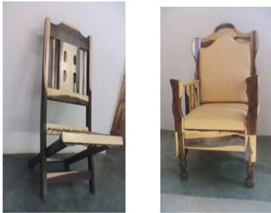
Figure 1. Chairs from a local industry made from Acacia burkea (left) and Spirostachys africanawood (right).

ure 1. Very little is known about properties of timber that is processed and used in local workshop.