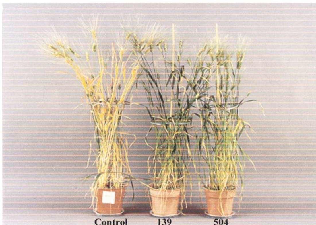
Fig. 1. The 'stay green' phenotype in durum wheat. Control plant, cv. Trinakria; 139, mutant 139; 504, mutant 504.

variable fluorescence ( F_v = F_m - F_o ) to maximum fluorescence ( F_m ) (Genty et al. , 1989).