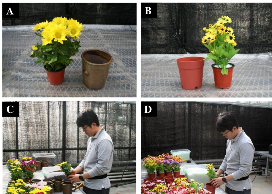
Figure 1 Photographs of materials used in experiments. (A) Real flower ( Chrysanthemum ); (B) artificial flower; (C) a subject doing horticultural activity; (D) a subject doing control activity.

Participants were randomly divided into two groups. On the first day of experiments, the first group (N = 8) carried out horticultural activity, while the second group (N = 8) performed the control activity. On the second day, each group switched activities as a crosscheck.