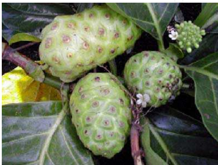
Fig. 1. Unripe fruit

The genus Morinda ( Rubiaceae ), which includes the species M. Citrifolia L., is made up of around 80 species. M. Citrifolia is a bush or small tree, 3-10 m tall, with abundant broad elliptical leaves (5-17 cm length, 10-40 cm width).