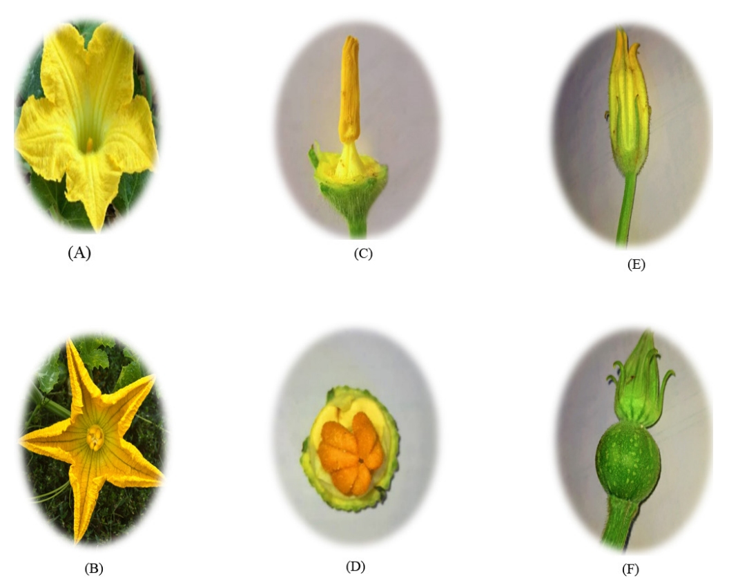
Figure 2. It shows (A) Female flower, (B) Male flower, (C) Anther and filament of male flower, (D) Stigma and style of female flower, (E) Peduncle of male flower, (F) Peduncle of female flower.

categories- carbohydrates, lipids, phenolics, terpenoids, and alkaloids (Huang et al., 2016). As shown in Table 2, the major phytochemicals in pumpkin flowers are carotenoid (373 mg/100 g) which is almost similar to other yelloworange flowers (marigold, sunflower, rose, and pansy) followed by gallic acid (17.39 µg/mL), quercetin (17.134 µg/mL), anthocyanin (11.2 mg cyn-3-Glu eq/100 g), and beta-carotene 800 mg/100 g (Kathina et al., 2015; Nayak et al., 2017; Ghosh and Rana, 2021). In comparison to the pumpkin flowers, the pumpkin fruit constitutes a higher amount of gallic acid 436 mg/100 g, quercetin 8.23 mg/100 g, and alkaloid content 180 mg/100 g, while the anthocyanin, beta carotene and carotenoid content of pumpkin flower are high (Oloyede, 2012; Carvalho et al., 2017; Khatib and Muhieddine, 2019; Kaur et al., 2020). The flowers can be stored at 10 °C for 5 days and it has been observed in a study that beta carotene content increased by 50% from 6 mg/100 g to 9 mg/100 g during storage (Kathina et al., 2015).