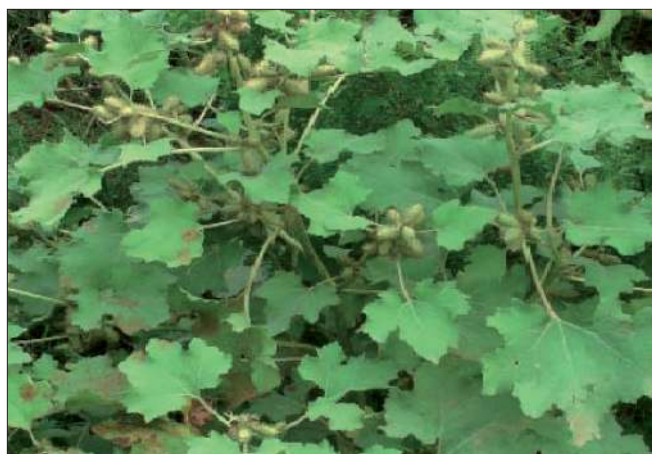
Figure 1: Xanthium strumarium L.

The leaves and roots are used for their anodyne, antirheumatic, antisyphilitic, appetiser, diaphoretic, diuretic, emollient, laxative and sedative activities. An infusion of the plant has been used in the treatment of rheumatism, diseased kidneys and tuberculosis. It has also been used as a liniment on the armpits to reduce perspiration. [14] The fruits contain a number of medically active compounds including glycosides and phytosterols. They are anodyne, antibacterial, antifungal,