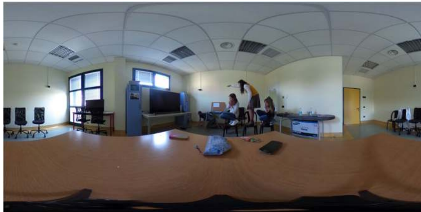
Figure 4. PIT 360°. Testing phase.