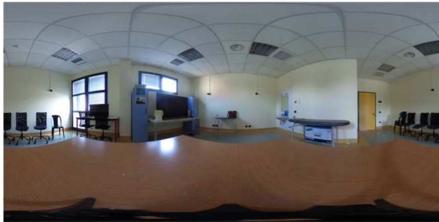
Figure 3. PIT 360°. Familiarization phase.

Procedure of the study. Participants underwent a conventional neuropsychological assessment to obtain their global cognitive profile and level of executive functioning (pre-task evaluation). Subsequently participants were asked to complete the PIT 360° (PIT 360° session). The PIT 360° was designed and administered through an innovative mobile application (PIT 360) that allows participants to explore an immersive 360° experience. At the end of PIT 360 task evaluation, subjects were asked to rate their affective reactions, perceived levels of challenge and skill, appreciation and sense of presence experienced while performing the PIT 360 task (post-task evaluation).