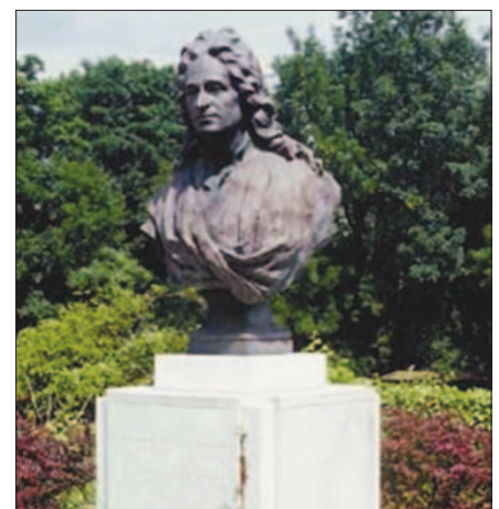
Fig. 3 Bust of Pierre Fauchard which stands in the grounds of Chateau Grandmesnil. This photograph was taken in 2001