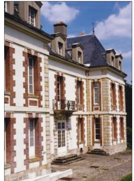
Fig. 1 Exterior of Pierre Fauchard's residence at Chateau Grandmesnil, photographed in 2001

Many of Fauchard's observations are as relevant today as they were in 1728. He condemned the reckless extraction of primary molars, realising it caused drifting of the permanent dentition, but he advised the removal of deciduous teeth when this was warranted to prevent malocclusion in the permanent dentition. Fauchard is regarded as one of the world's first orthodontic specialists. He urged caution in the use of endodontic reamers, warning against breakage and swallowing, valuable advice still relevant to modern dental practice. Dental practice insurers regularly report the incidence of claims for swallowed endodontic instruments and the lack of defence for such negligence. 9 The significance of the relationship between systemic and oral disease is highlighted in his work. Fauchard adopted a scientific