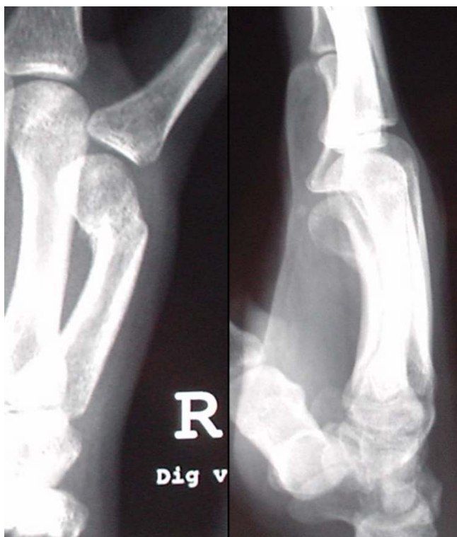
Figure 1 Malunion of the fifth metacarpal bone of the right hand.

tals produce electrical current while under mechanical pressure. The reciprocal effect, by which the crystals are deformed when under electrical current, was then discovered a while later. This is the effect being used by the Piezosurgery Device ® . In this device, the electrical field is located in the handle of the saw [3]. Due to the deformation caused by the electrical current, a cutting – hammering movement is produced at the tip of the instrument. These micro movements are in the frequency range of 25 to 29 kHz and, depending on the insert, with an amplitude of 60 to 210 \mu\text{m} . This way only mineralized tissue is selectively cut. Neurovascular tissue and other soft tissue would only be cut by a frequency of above 50 kHz [3-5]. Depending on the strength of the bone and the blade geometry, the efficiency of the cutting can be regulated by the frequency modulator and the power level. For cooling there is an integrated pump with five different working levels. This pump automatically washes physiological solution to the area being cut. The cost of the device is about 7.000 USD. Additional costs per operation are for the cooling liquid and are in the range of a few dollars. We have used the Piezosurgery Device ® by Mectron [Italy] [3] for the first time in osteotomies of the long bone in the field of hand surgery. We will report on our experience with one case, with a follow up time of one year.