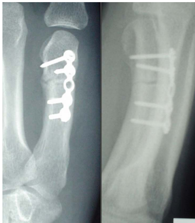
Figure 4 The correction obtained with closing wedge osteotomy.

ess using this new device, although in the future, it should be possible to minimize the bony exposure. In our patient the postoperative healing of the wound and the bone consolidation (Figure 4) were smooth. The duration of postoperative sick leave was four weeks which is more rapid than the usual recovery period. The patient regained full use of his finger according to the state before the fracture. At no point was there any loss of sensitivity. The patient as well as the surgeons were fully satisfied with the result.