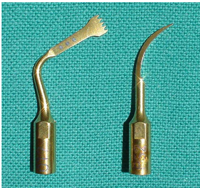
Figure 3 Two examples of available tips. Left side: The preferred blade.