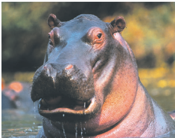
Cool customer: hippos create their own antibiotic sunscreen.

This diluted red solution was carefully concentrated to about 10^{-5} M; no further concentration was possible as the solution would have polymerized and turned brown. Subsequent purification by gel filtration and on an ion-exchange resin yielded solutions of two pigments, one red and one orange. We characterized these samples by spectroscopy (ultraviolet spectrum, 1 H NMR, electrospray ionization and fast-atom bombardment mass spectroscopy). We also converted the labile red pigment into a stable t -butyldimethylsilyl (TBS) derivative and determined its structure by X-ray crystallographic