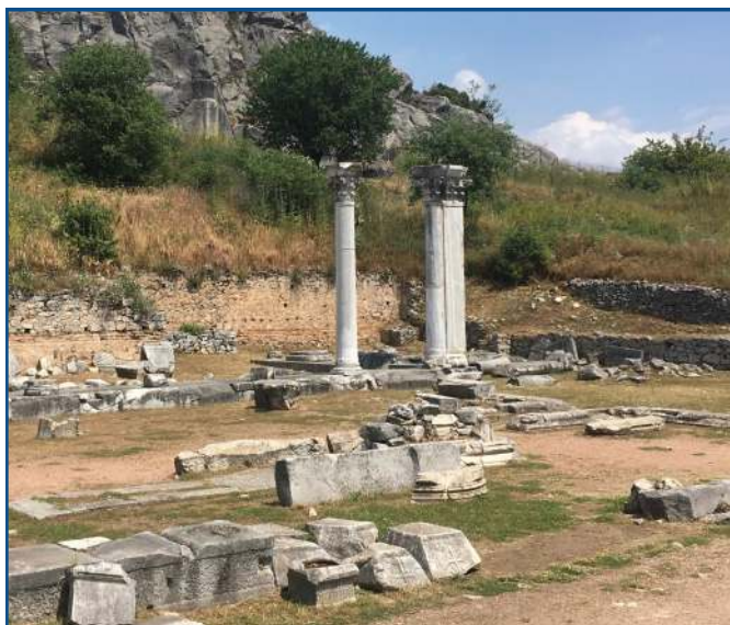
Figure 1(a) : Ruins of Early Christian Basilica in Philippi