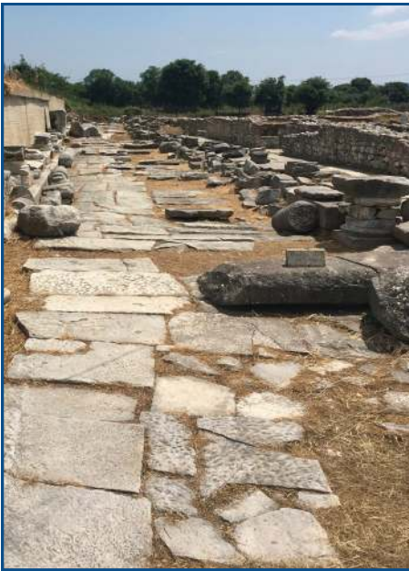
Figure 2(a) : Segment of the Via Egnatia in Ruins of Phillippi