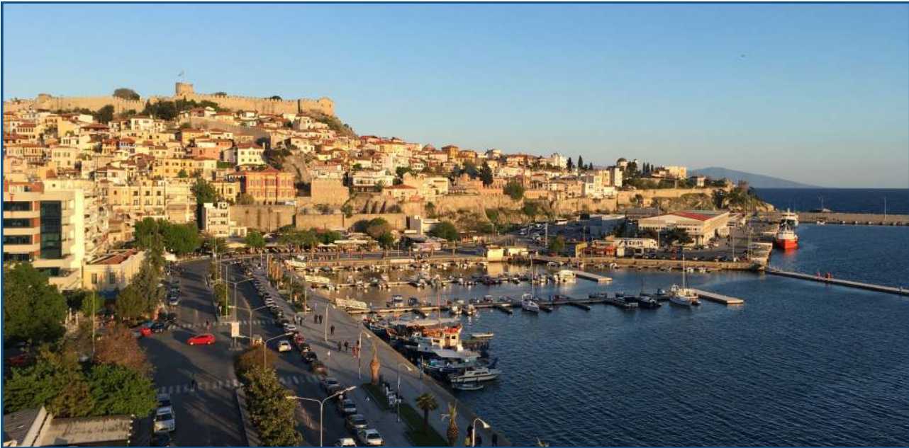
Figure 4: Harbour of Kavala with Medieval Fortress