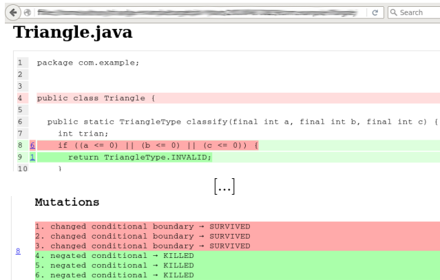
Figure 1: Example of output of PIT.

The HTML report generated by PIT uses a colour code to show both the line coverage and the mutation score, see Figure 1 that displays a report on an example application 2 . Light green lines correspond to code coverage with no mutant generated: line 11 in the example. Dark green correspond to the lines for which tests were executed and failed (which means the mutants were killed): this represents the mutation coverage , for instance lines 9, 12 and 13 in the example. Light pink shows lines with no code coverage (outside the scope of the tests): line 4 in the example. Dark pink is used to show instructions on which mutants were generated and not detected by the tests (surviving mutants): line 8.