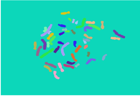
(a) Actual Classmap