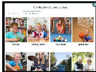
Figure 3: The library of pre-defined activities.