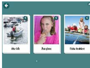
Figure 2: The user's favourite activities.