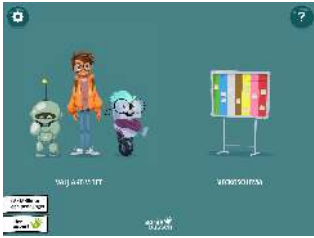
Figure 1: The start view of Plan&Do.