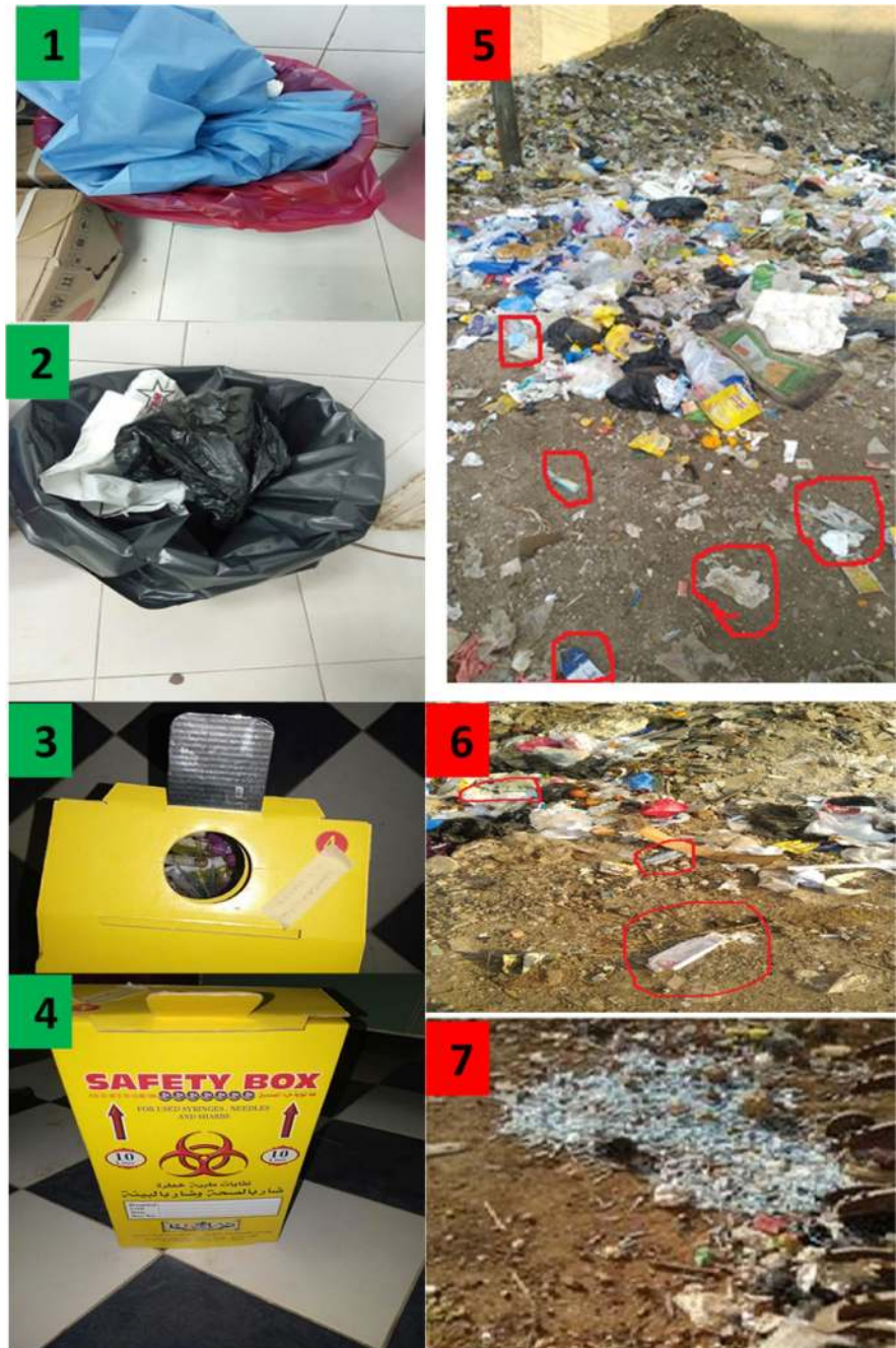
Fig. 2 Various containers used by medical institutions for the disposal of hazardous healthcare wastes in Egypt (photos no. 1, 2, 3, and 4). Hazardous healthcare wastes that were disposed of without appropriate safety measures in piles of household garbage in Egypt (photos no. 5, 6, and 7)

COVID-19 provided an urgent call for more interest in proper healthcare waste disposal techniques. During the COVID-19 pandemic, healthcare waste management became a serious problem that faces medical staff throughout the world (WHO, 2020b). COVID-19 is expected to cause a wide range of