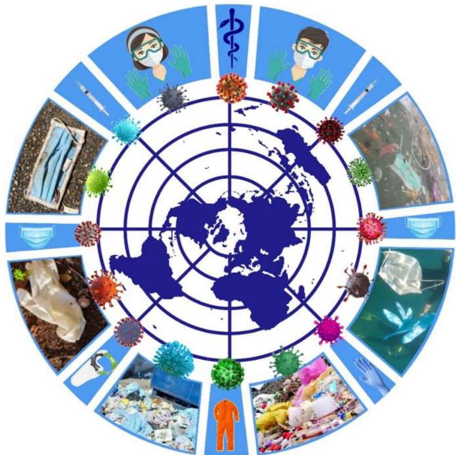
Fig. 1 The environmental impacts of COVID-19 are an important global issue, particularly after the second wave. There are multiple problems caused by COVID-19, which includes disposal of several medical and healthcare wastes (mainly face masks and gloves) and direct or indirect links between wastes and the risks of COVID-19 transmission in different environments including soil and water

Wastes can be a significant resource when we can use them, for example, as organic nutrient sources to support agricultural production or as an energy source, or recycle them, but hazardous wastes need to be disposed of in a safe way. The production, handling, and management of wastes (particularly healthcare wastes) differ in developing countries compared to developed countries, as developing countries tend to have fewer regulations that oversee waste management (Fig. 2). In turn, these developing countries suffer adverse impacts to public health (Diaz et al., 2005; Elbehiry et al., 2020). Many studies have reported on the handling, treatment, and management of wastes in developing countries